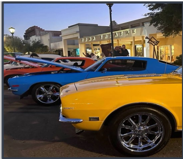
Rally on Main!