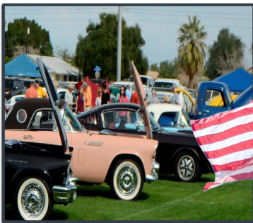
950+ Classic Cars!